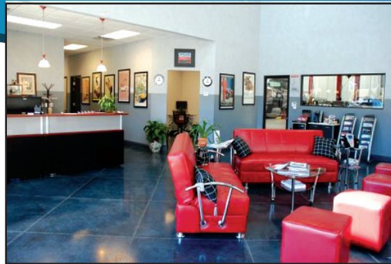
Spacious Waiting Area with Wi-Fi with Computers Available for Customers

Includes a written report with repair estimates Only $75.00